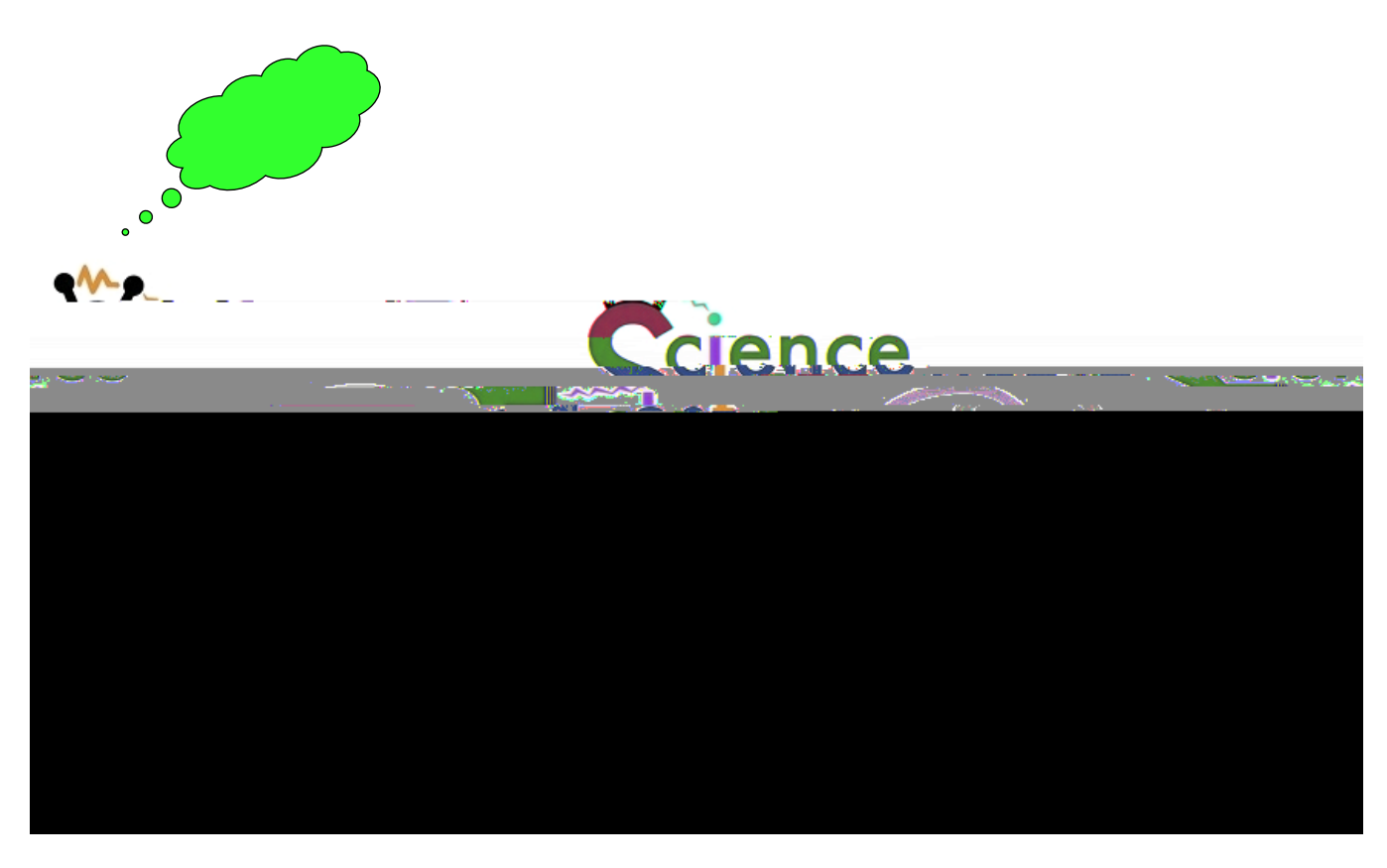
Dawson College – December 2015